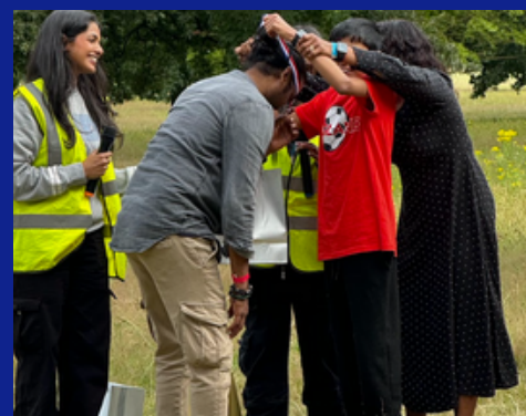
Volunteers & Awards